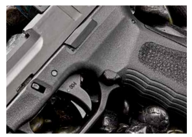
The slide-stop lever is long and low-profile, and the magazine release button is short, requiring a full press to release the mag. All controls, including the trigger, are made of polymer.