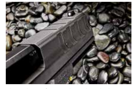
The polymer front sight is the Glock type. The front of the slide is contoured and features wide, wrap-around serrations.

The barrel is made of stainless steel with what I believe is a nitride coating for corrosion resistance. It sits inside a slide that has aggressive and wide flat-bottomed serrations at the front and rear. At the front, these wrap over the top, which is a very nice touch. Angled slide serrations look classier, perhaps, but most firearm manufacturers seem to be moving to flatbottomed serrations for two reasons: First, ease of machining. Second, and