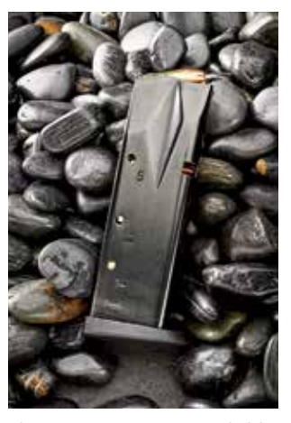
The one magazine was reliable with all 9mm loads. A 10-round mag is optional, and a 17rounder will be available soon.

As this was a new — at least to me — design, one meant for concealed carry, I tested the most important aspect of any handgun meant for personal defense: Reliability. At the range, I tried a number of different hollowpoint bullet types and weights. Recoil got a bit spicy when I shot +P ammunition, but that's what I expected with a pistol of this size and weight. I'm pleased to report that