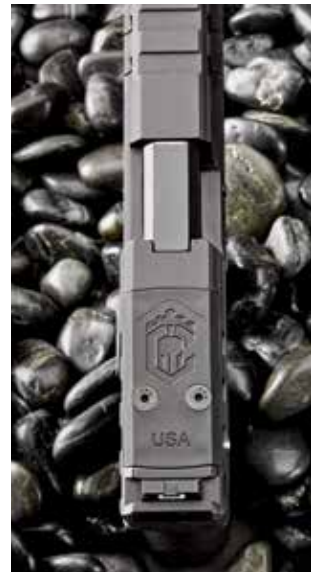
Out of the box, the Centurion CP9 includes a polymer coverplate with Citadel logo to protect the factory optic cut.

Just forward of the rear sight you'll spot a polymer plate, which is as the pistol comes from the factory. Remove that plate and you'll see the slide has been machined to accept certain optics. You can directmount optics with either the Trijicon RMR or the Doctor, Vortex Venom and Burris Fastfire 3.