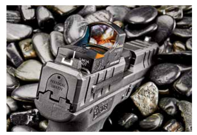
With an optic mounted, the polymer sights do not co-witness with the red dot. However, the FastFire 3 features a white line that could aid left-to-right alignment in case of a dead battery.

more important (at least to you), flat-bottomed serrations seem to be the most aggressive, and the least likely to slip out of your fingers if they're sweaty or bloody; those 90-degree angles just dig in to help you hold on.