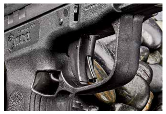
The trigger features a safety lever in the center that protects against unintended trigger pulls. The trigger face is smooth, and the break was found against the frame after 5½ pounds.

Truth bomb here: I'm on record for repeatedly blasting Glock factory sights. Polymer sights have no place on a premium-priced pistol meant for law enforcement and military use, as I see it. The Glock factory sight picture has always been flawed; if you position the front sight so you can see all of the white dot, the top of the front sight sits above the notch. Line them up properly, and the bottom of the dot is cut off. Therefore, precision is difficult. On an entry-level pistol priced 40 percent less than a Glock, these sights are perfectly acceptable. And, if you ever decide to upgrade them, companies who make sights make versions to fit the G19, and thus this gun.